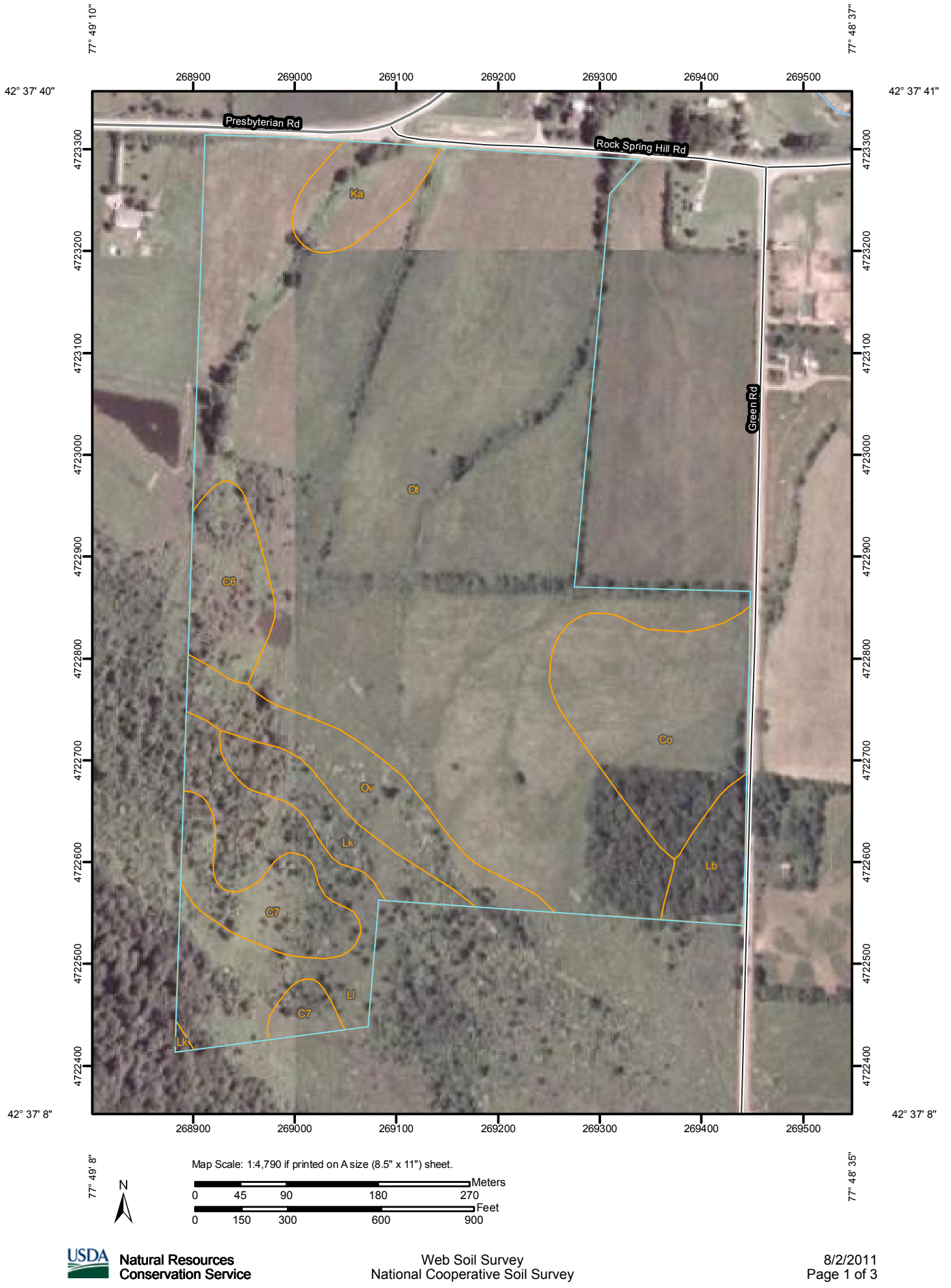
Soil Map—Livingston County, New York