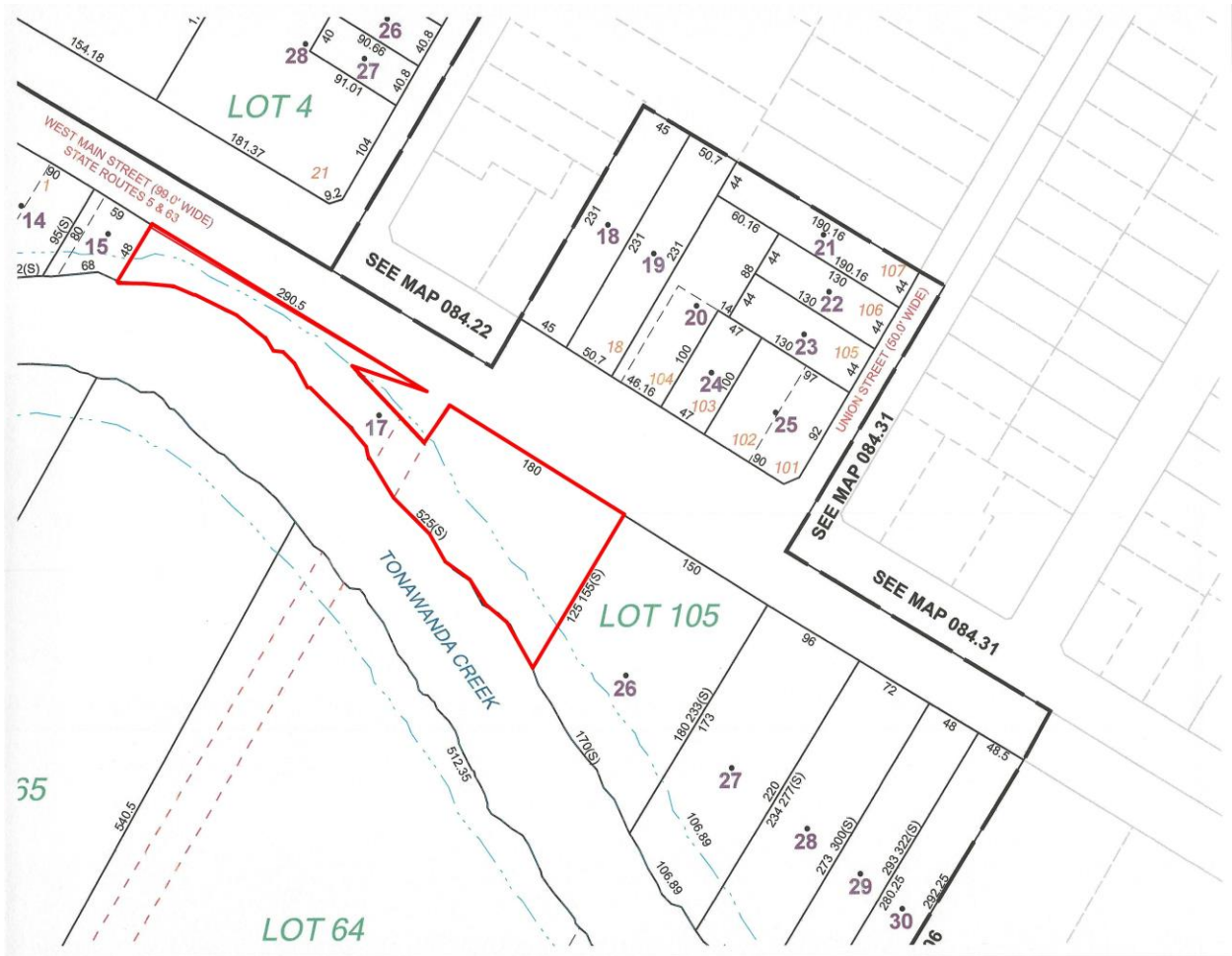
355 East Main Street Tax Parcel